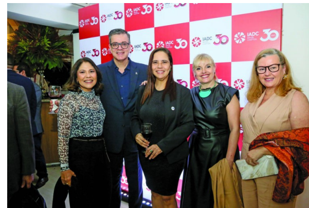
Members in Brazil attended a celebratory event to commemorate the IADC Brazil Chapter's 30th anniversary in 2024.

IADC's International Development team champions the interests of its global membership through a network of regional representatives and chapters strategically positioned across Europe, the United Kingdom, Brazil, Latin America, the Middle East, Africa, Asia Pacific and Australasia. These local entities play a crucial role in advancing IADC's mission worldwide.