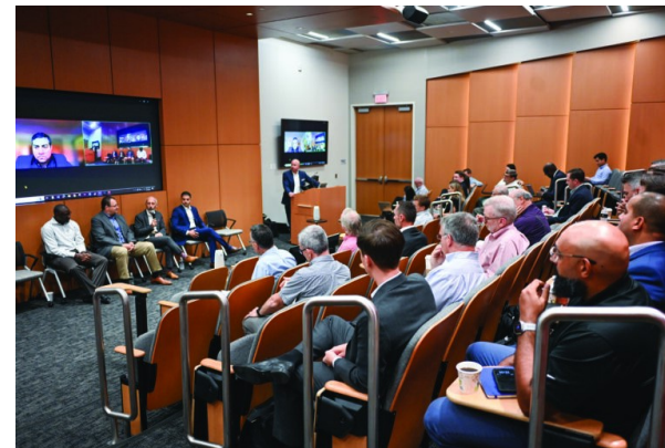
The IADC Drilling Engineers Committee's Q3 Tech Forum brought together industry experts to discuss the topic of digital drilling engineering. The in-person component of this hybrid event took place at NOV's Houston facility.