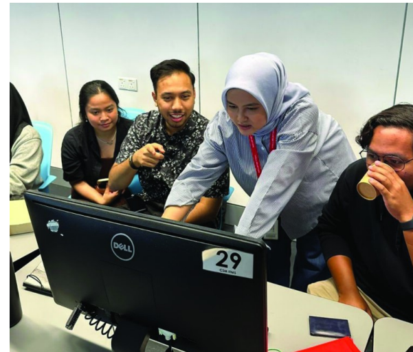
The IADC Student Chapter at the Universiti Teknologi PETRONAS hosted a training session

These learning institutions have joined the IADC Student Chapter Program since last fall: