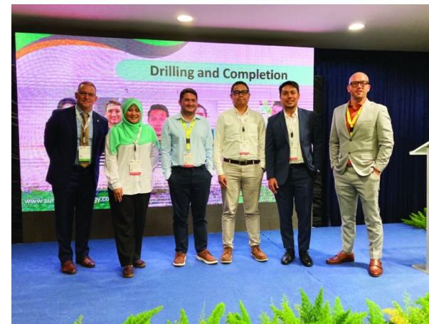
IADC hosted a technical session on drilling and completions technologies featuring experts from various companies at the 2024 Suriname Energy, Oil & Gas Summit.

In September, the IADC Latin America Chapter and IADC headquarters hosted the first IADC Latin America Regional Forum in Mexico City. Industry professionals and students gathered to discuss specific challenges and opportunities within this region.